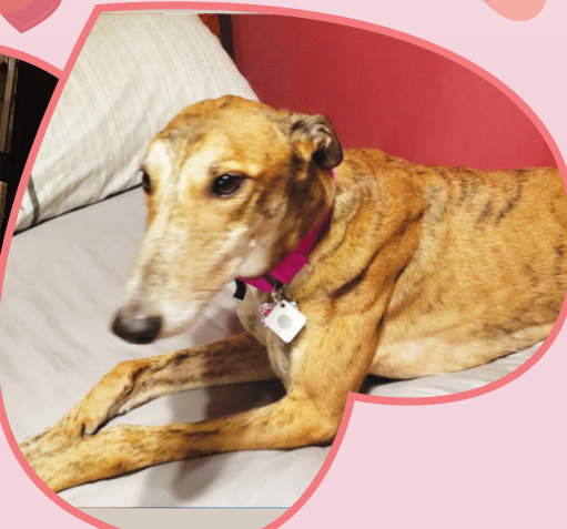
Xena the Warrior Princess having trouble getting up on the bed in her adoptive home in Michigan earlier this month.