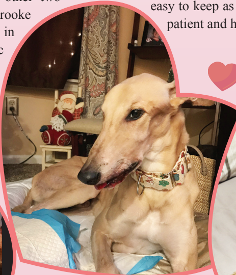
Mattie after he was desexed and had all his teeth taken out resting in his foster home in Michigan earlier this month.